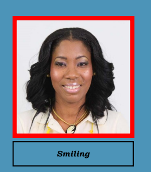
POSE AND EXPRESSION