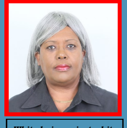
White hair against white background