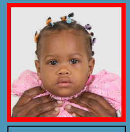
Parent hand in picture