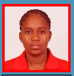
Red bleeding from blouse