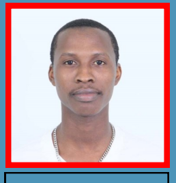
clothing blends into background